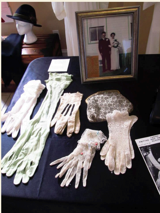
Part of a Wedding Trousseau