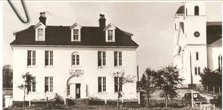
St. Anne Hospital 1959

The Isle Madame Historical Society's mission is to collect, preserve and exhibit artifacts and documents relating to the social, cultural and natural history of Isle Madame for the education and enjoyment of present and future generations.