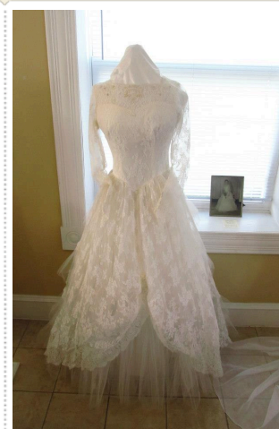
Wedding Dress 1962