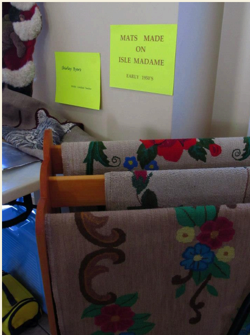
Rugs made on Isle Madame 1950's