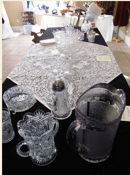
Nova Scotia Glass